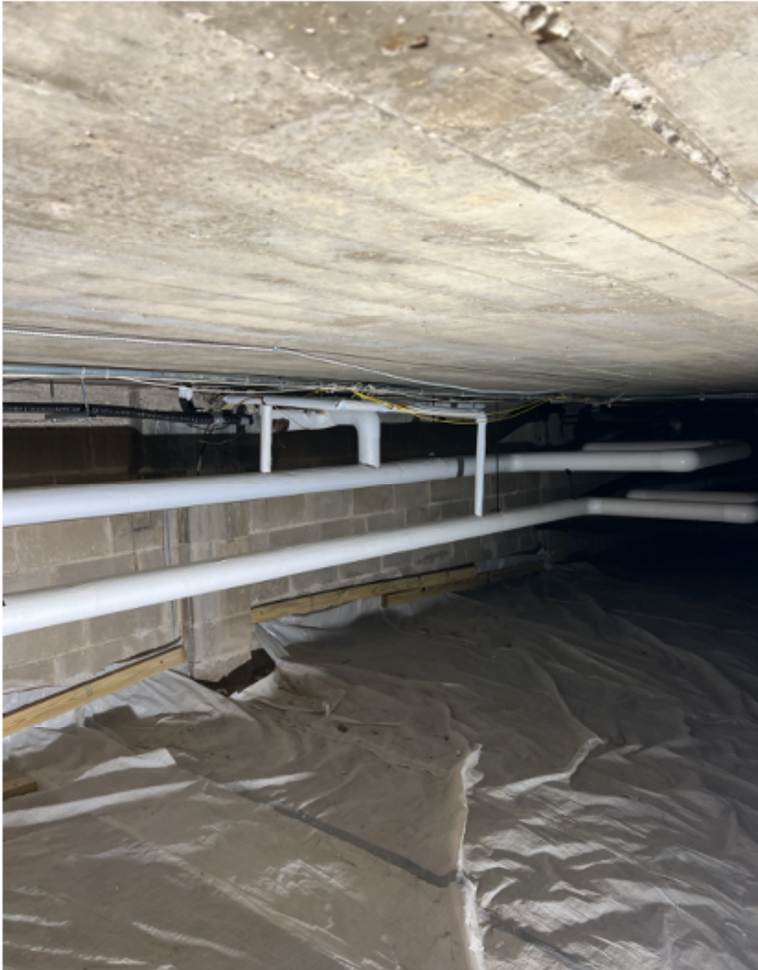
Completed Steam Lines at Lloyd Crawlspace