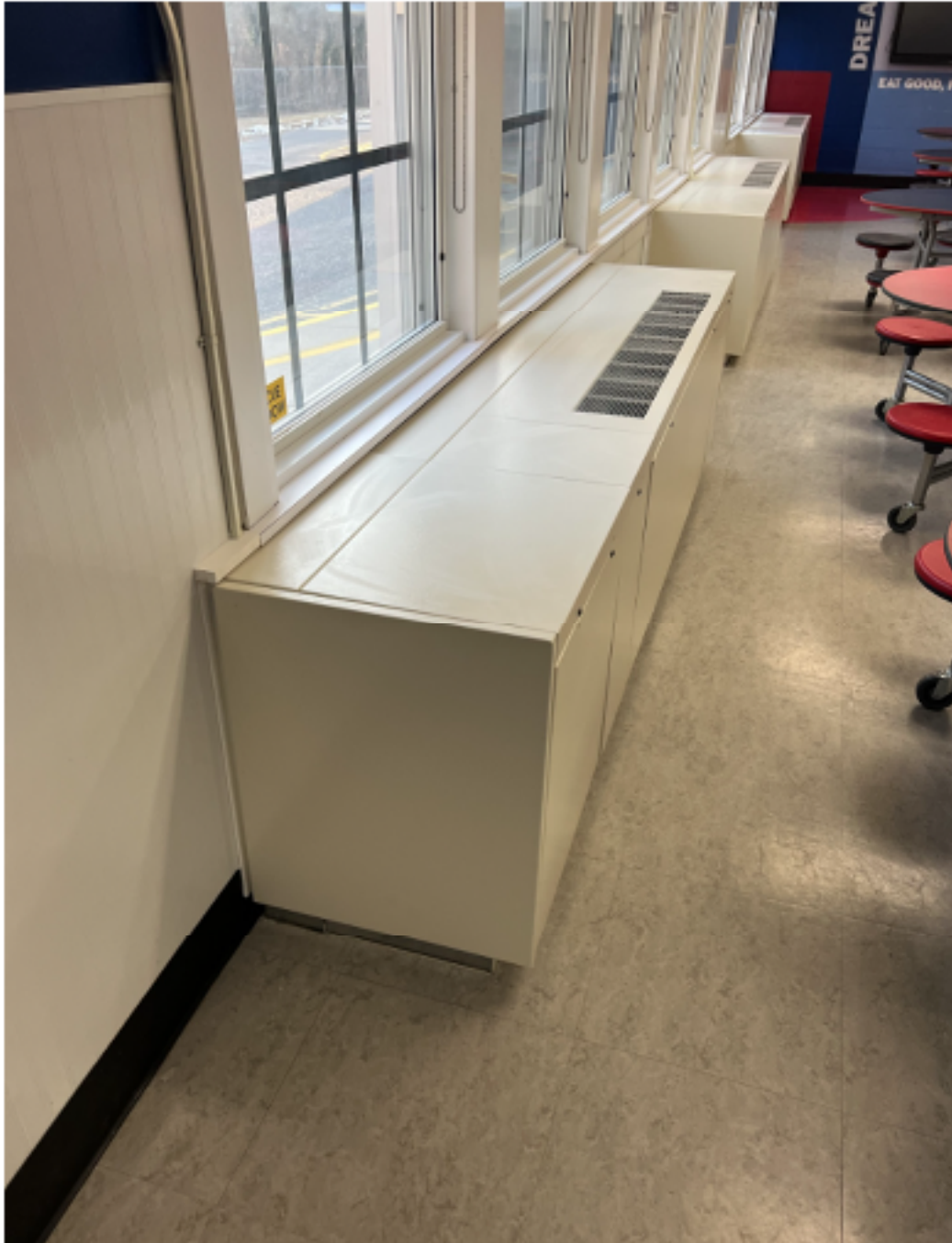
Lloyd's UV's Trimmed and Panel Adjustments